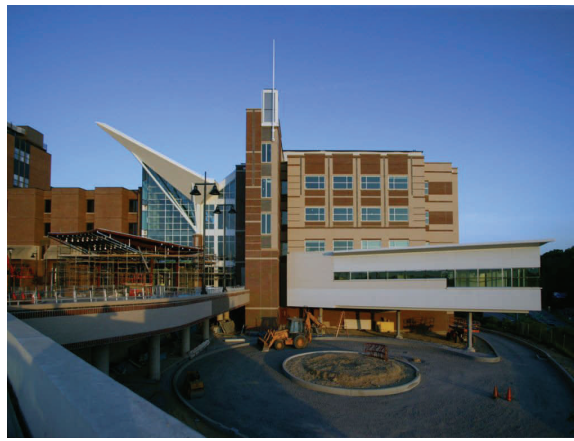
York Hospital Patient Care Tower York, PA