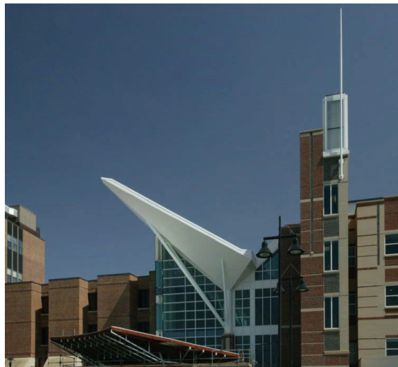
York Hospital (PA)