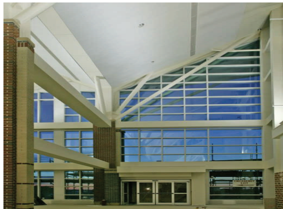
York Hospital (PA) - Interior Pavilion

York Hospital , York, PA Patient Care Tower and Renovations