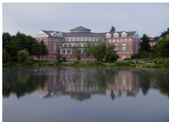
Bates College Pettengill Hall Lewiston, ME