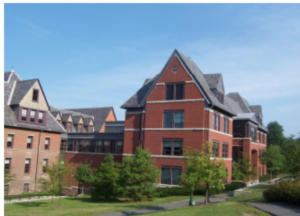
Cornell University Lincoln Hall Ithaca, NY