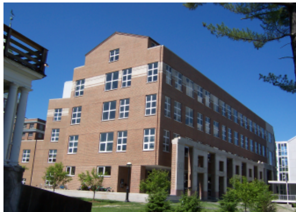
Dartmouth College Baker-Berry Library Hanover, NH

New, four-story, 52,000 SF building occupies a prominent site facing Mount Hope Bay on one side, and completing the main campus green space on the other side. A bold curved form facing the quad leads to framed views of the bay, while a broad entrance allows glimpses into and through a three-story atrium at the heart of the building. The program includes eleven classrooms, a multimedia production studio, and faculty offices for several academic departments. The atrium serves as a major campus public space for events, celebrations and exhibits. Building received LEED Silver Certification. It was completed in 2009 with an approximate construction cost of $20.0M.