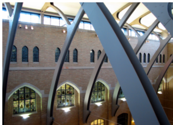
Yale University Irving S. Gilmore Music Library New Haven, CT