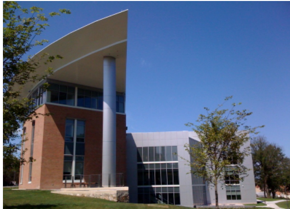
Roger Williams University Global Heritage Hall (top left & above) Bristol, RI

Harvard University , Cambridge, MA Austin Hall Renovations (Law School) Boylston Hall Renovations Langdell Hall Law School Library Renovation and Alterations Rockefeller Hall Renovations (Divinity School)